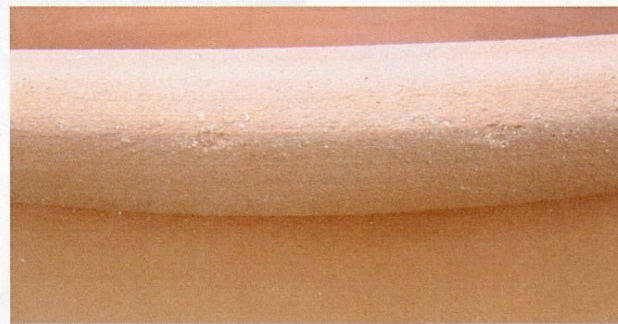
Amostra de Barro